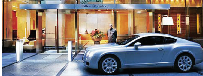
Hilton Sydney Hotel 488 George St, Sydney

Women Lawyers Association of NSW Inc. ABN 19 092 974 880 DX7304 Wyong/ 14A Lonsdale Close, Lake Haven 2263 Ph: 02-4392 1185 Fax: 02-4392 9410 Email: executive@womenlawyersnsw.org.au